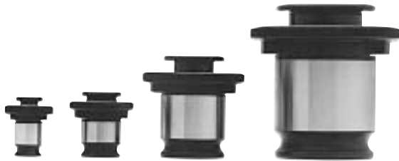
TAP ADAPTER DIMENSIONS